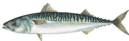
Makrel = 30 cm