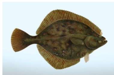
Flounder /Skrubbe = 30 (only 2)