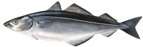
Coalfish/Mørksej = 45 cm