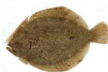
Brill/Slethvar = 35 cm