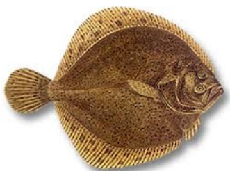
Turbut/Pighvar = 35 cm