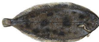
Sole/Søtunge = 30 cm

- Fish not valid: Ide/Rimte, Eel/Ål and Lumpfish/Stenbider.