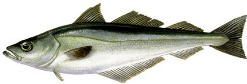
Pollack/Lubbe = 45 cm