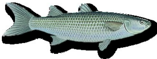
Mullet/Multe = 45 cm