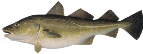
Cod/Torsk = 45 cm