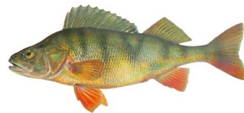
Perch/Aborre = 30 cm