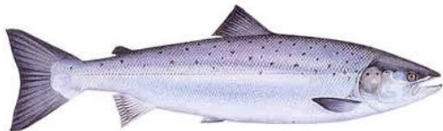
Salmon/Laks = 60 cm