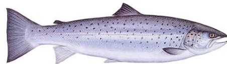
Seatrout/Havørred = 45 cm